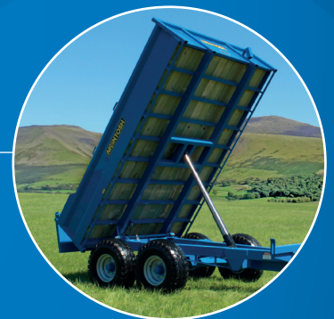
Single rams on all trailers for better stability on hills